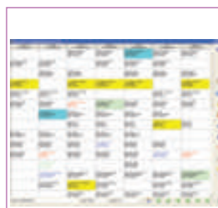
DEPARTMENT ROTA EXAMPLE