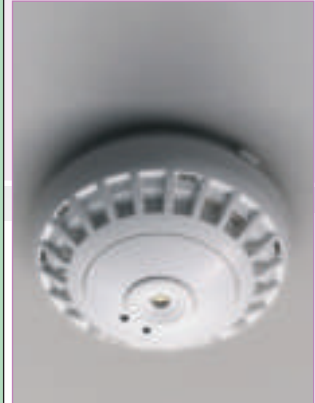
INDOOR PEOPLE COUNTER

Engineer needs IWC 2044 and ISU0004 loaded on a laptop with serial port to configure the Tailgate Detector.