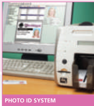
PHOTO ID SYSTEM