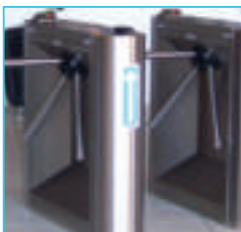
TRIFLO PREMIER TURNSTILE

All controlled units are supplied complete with Push Button (Foot Pedal operation is an available option). Other control methods are available by quotation only. If a controlled unit is required, please specify controlled direction, for example controlled entry/free exit, left hand or right hand unit required at time of order.