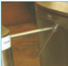
ELITE ULTRA TURNSTILE

All controlled units are supplied complete with Push Button (Foot Pedal operation is an available option). Other control methods are available by quotation only. If a controlled unit is required, please specify controlled direction, for example controlled entry/free exit, left hand or right hand unit required at time of order.