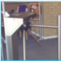
TRIFLO SENTRY TURNSTILE