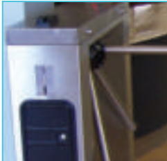
TRIFLO CONSOLE TURNSTILE

All controlled units are supplied complete with Push Button (Foot Pedal operation is an available option). Other control methods are available by quotation only. If a controlled unit is required, please specify controlled direction, for example controlled entry/free exit, left hand or right hand unit required at time of order.