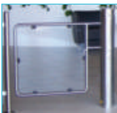
ROTOGATE FULL DEPTH ARM

All controlled units are supplied complete with Push Button. Other control methods are available by quotation only. Please specify at time of order if left hand or right hand unit is required.